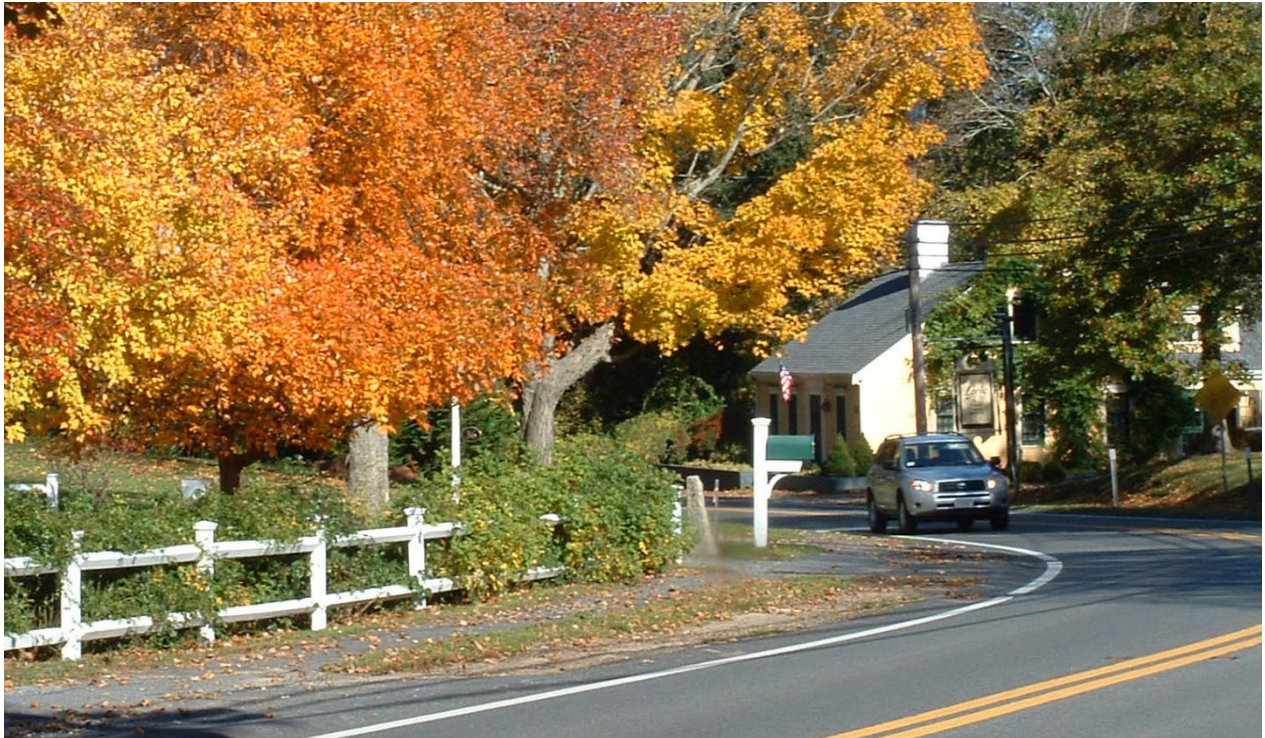
Old King's Highway, Yarmouth Port

2021 designation makes it one of four in Massachusetts